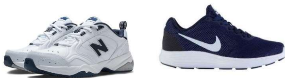
Acceptable as a sports shoe