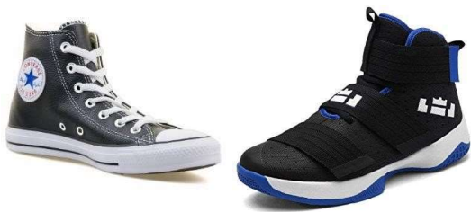
Not permitted as a sports shoe